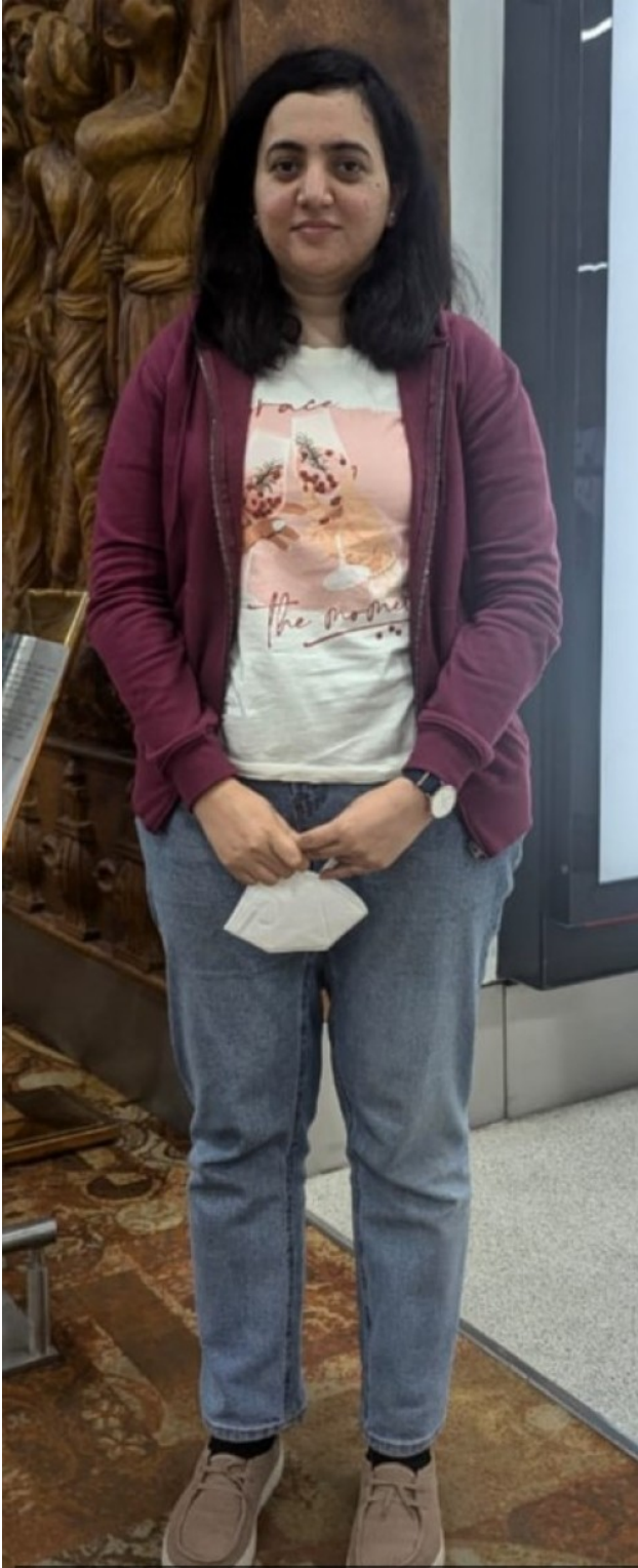
Address: G4W3+CF New Delhi, Delhi, India Lat: 28.5460285 deg, Long: 77.1036708 deg Date & Time: 17/02/2025 06:47 PM GMT +05:30